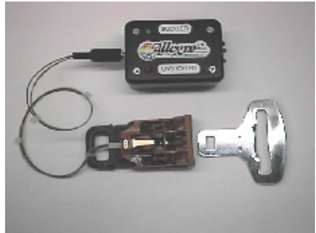
Figure 3. Typical mechanical assembly of seat belt buckle, showing electrical connection to Hall-effect sensor IC.

Choosing the right sensor IC is critical to meeting all the application requirements.