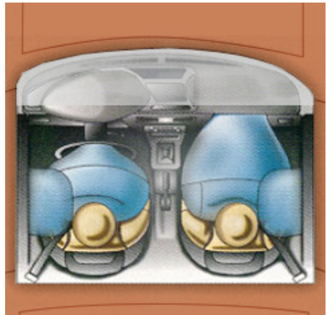
Figure 1. Front- and side-impact air bags require precise data on the location of the seats and occupants.

There can be any number of zones depending on how many Hall-effect sensor ICs are used, assuming two sensor ICs per seat track, four zones would be possible. The information, provided by the Hall sensor IC, is processed by the controller to determine the seat position relative to the steering wheel. A seat that is in one of the closer zones to the steering wheel would indicate to the controller unit that a lower