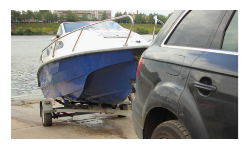
The A19360 enables enhanced automatic parking, superior low-speed control in dense environments, and better overall vehicle control.