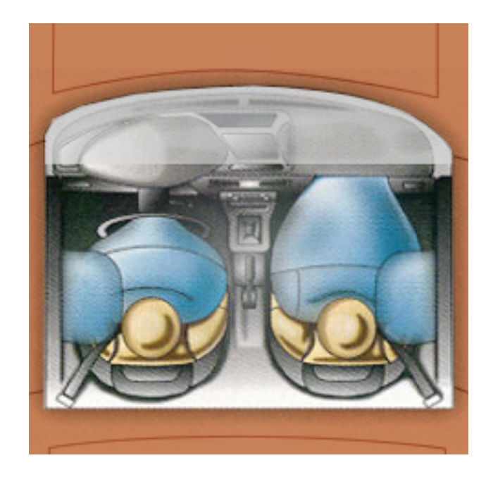
Figure 1. Front- and side-impact air bags require precise data on the location of the seats and occupants.

There can be any number of zones depending on how many Hall-effect sensor ICs are used, assuming two sensor ICs per seat track, four zones would be possible. The information, provided by the Hall sensor IC, is processed by the controller to determine the seat position relative to the steering wheel. A seat that is in one of the closer zones to the steering wheel would indicate to the controller unit that a lower