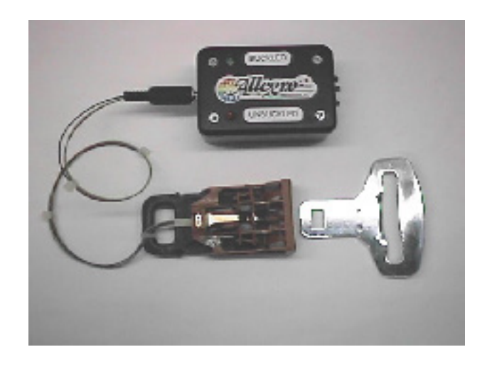
Figure 3. Typical mechanical assembly of seat belt buckle, showing electrical connection to Hall-effect sensor IC.

Choosing the right sensor IC is critical to meeting all the application requirements.