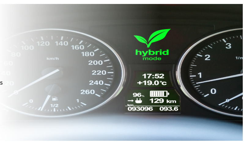
See figures 2 and 5 illustrations on back cover

Allegro's 0 to 400 A sensors offer highly accurate, industry-proven, fully integrated solutions that can help minimize footprint and BOM for resource-conscious users.